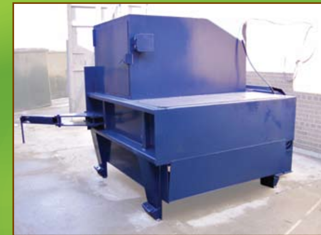
Hinged Door Hopper