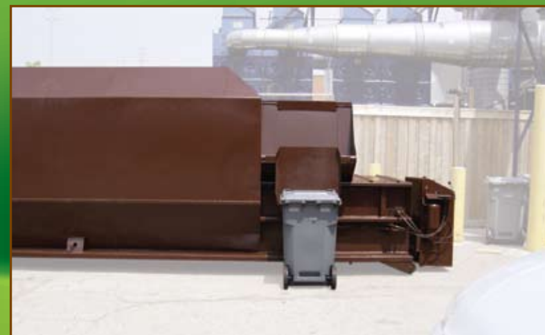
Enclosed Hopper with Cart Dumper