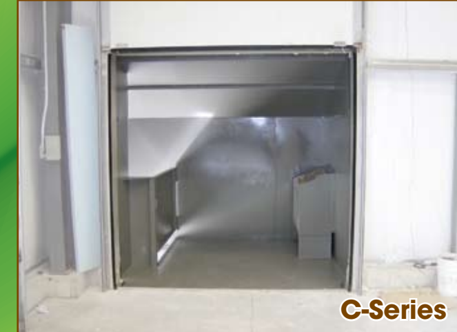
Walk-on Weather Encl. Interior