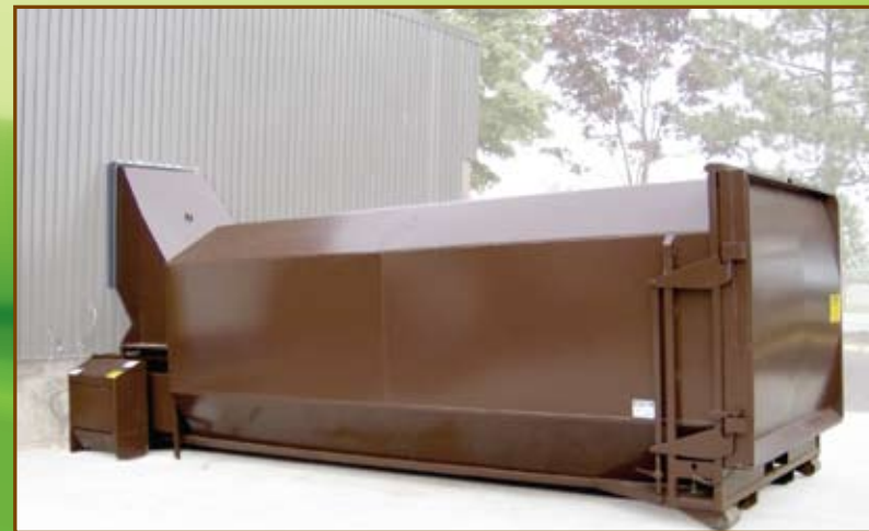
Rear Wall Chute