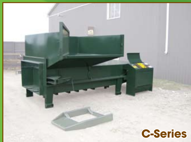
Open Hopper with Access Door