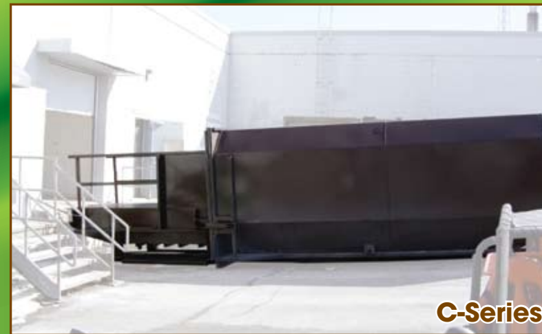
Walk-on Deck with Safety Railing