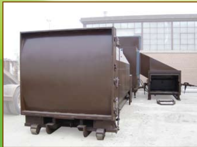
Weather Enclosure with Side Chute