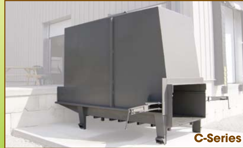
Walk-on Weather Enclosure