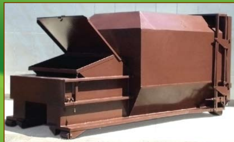
Rear Counter Balance Lid