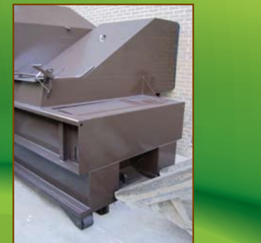
Retractable Manual Crank Chute