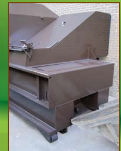
Retractable Manual Crank Chute